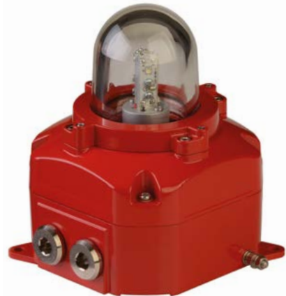
D2xB1XH1 / D2xB1XH2