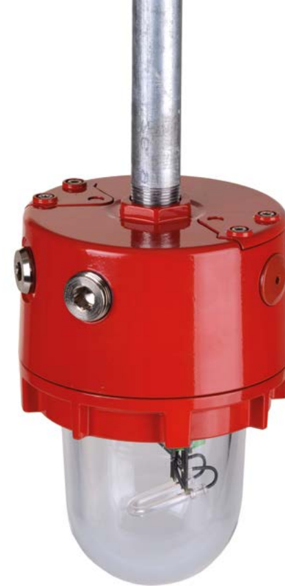
D1xB2XH1/XH2 - pendant mounting